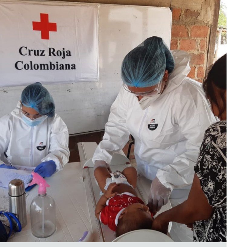
Colombian Red Cross Society provides critical medial care during the pandemic to indigenous migrant communities living along the border with Venezuela.