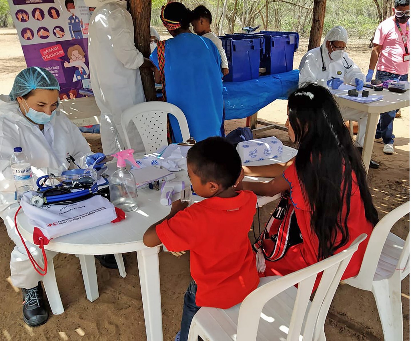
Colombian Red Cross carries out COVID-19 health promotion activities, including delivery of hygiene kits, to migrants in the border area of La Guajira, Colombia.