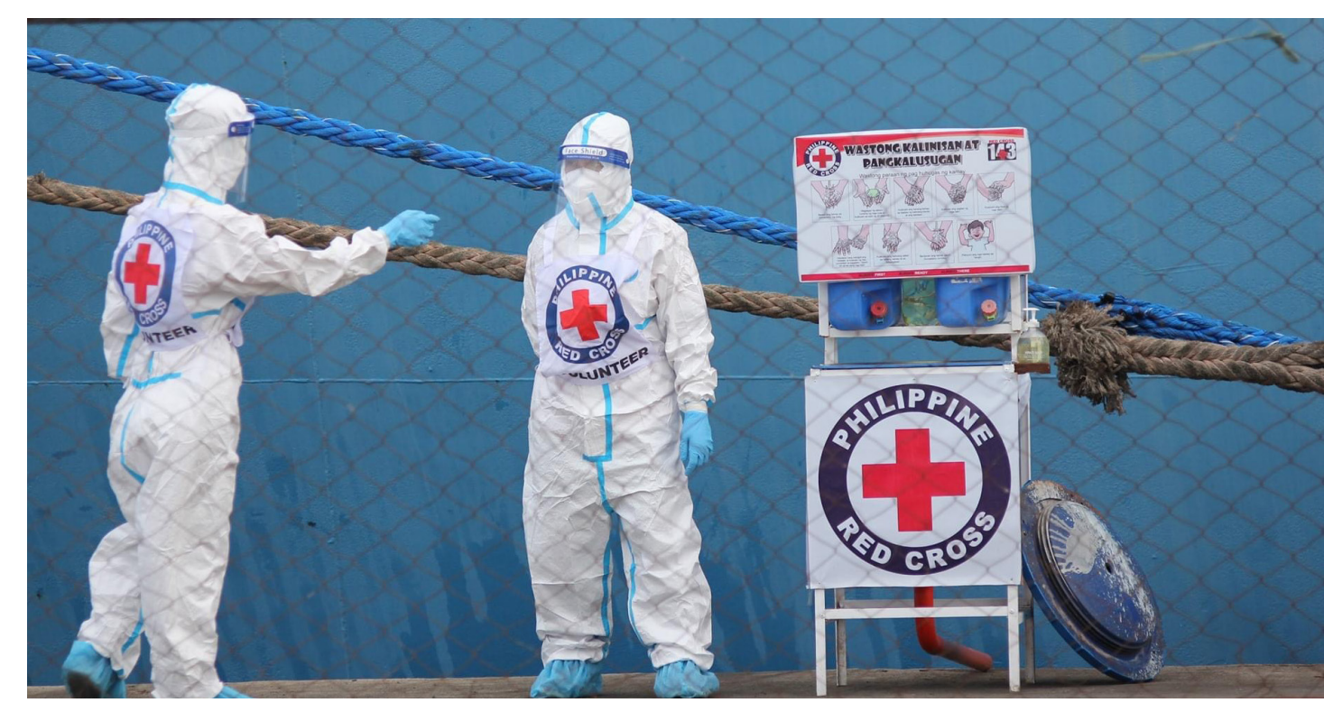
Volunteers from the Philippine Red Cross ensure water and sanitization stations are available to returning migrants.

Migrants are not immune to the pandemic and its impacts; indeed, they have been disproportionately affected. The limited data available on COVID-19 cases by country of origin commonly show a significant over-representation of migrants.<sup>24</sup> Since the publication of the aforementioned IFRC Least Protected, Most Affected report, it is clear that the heightened risks and vulnerabilities faced by migrants during the pandemic remain. As the focus on COVID-19 vaccination plans advances, there is a real risk that migrants may be left behind.