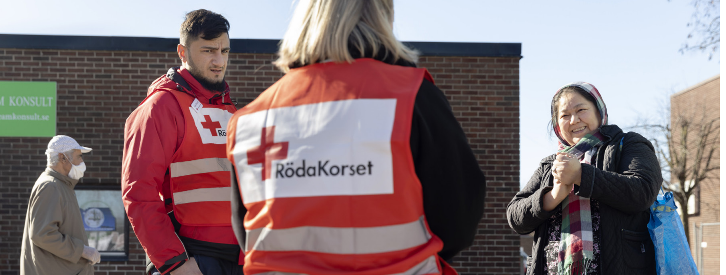
Swedish Red Cross provides key COVID-19 information to migrants, including how to prevent transmission and where to access support.

pandemic and, in recent months, faced impossible choices between buying food and accessing phone credit to keep in touch with families and service providers.